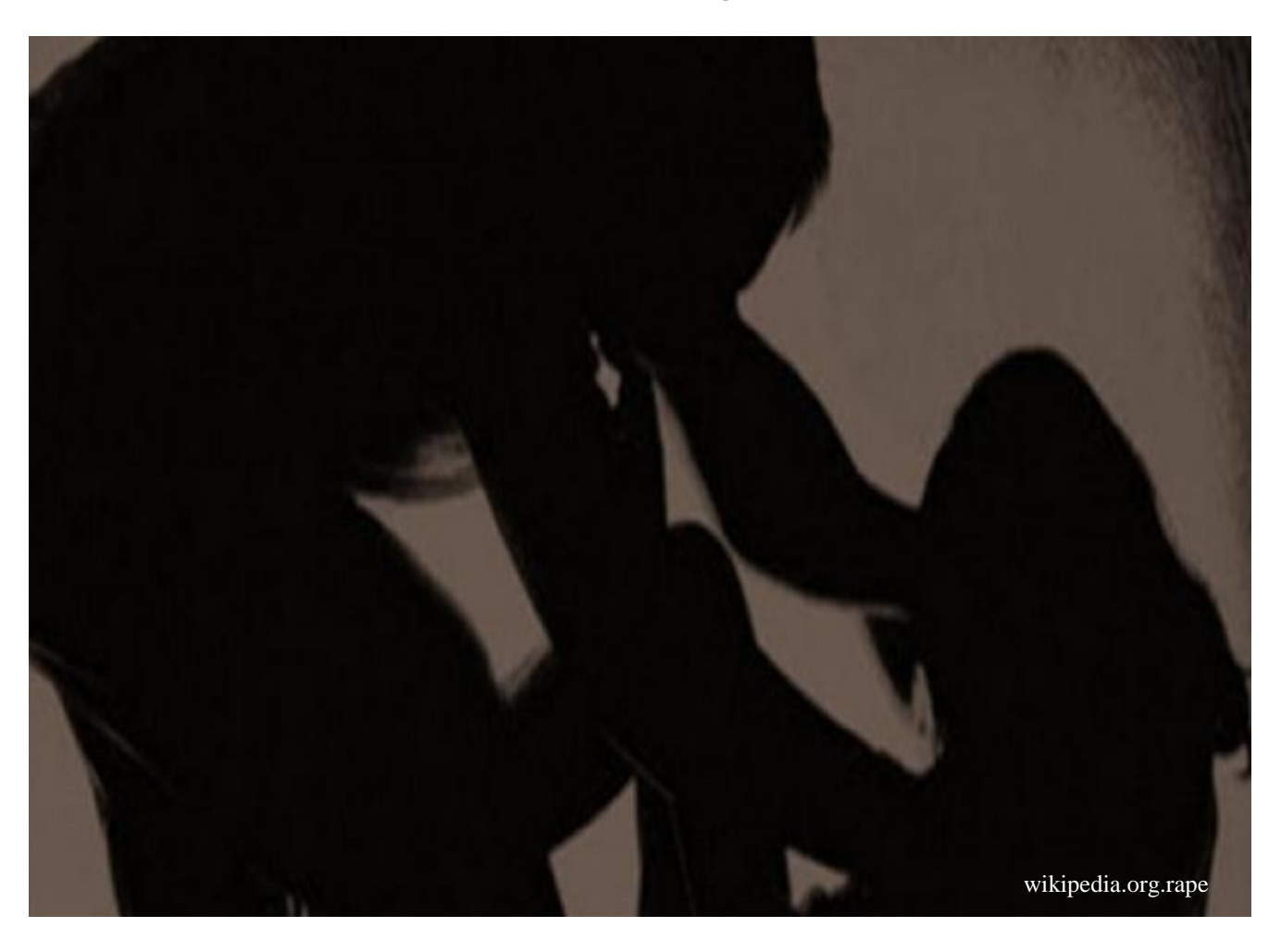
The need to amend the Timor-Leste Penal Code